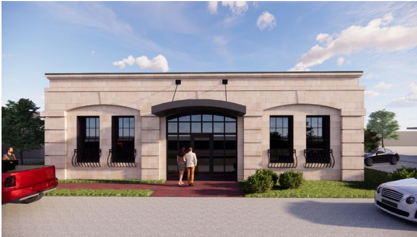
The Robert Henri Art Gallery

East of Hwy 385 on your way to Alliance at the "T" there is an incredible expanse of badlands. This painting is an acrylic on stretched canvas. It is framed with a simple box wood frame.