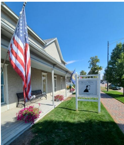
The Robert Henri Museum