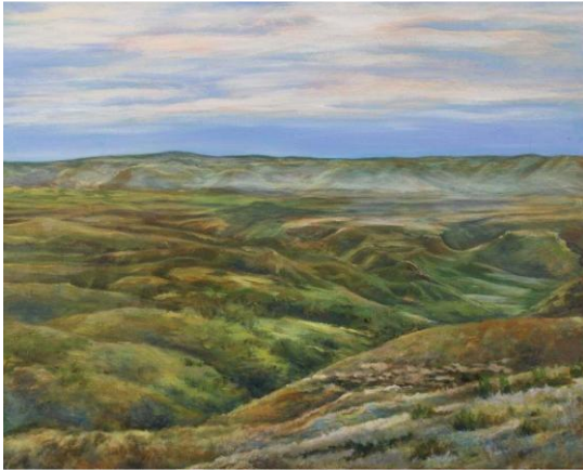
Badlands 24 x 30 in acrylic on canvas by Jenifer Berge Sauter

East of Hwy 385 on your way to Alliance at the "T" there is an incredible expanse of badlands. This painting is an acrylic on stretched canvas. It is framed with a simple box wood frame.