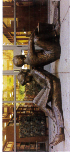
Knowledge and Understanding