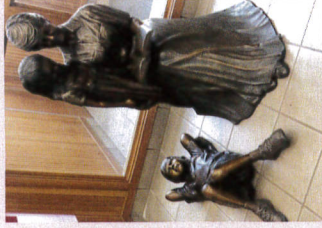
A Heritage of Love and Learning