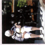
Two Kids on a Bench