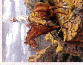
Upon a Ridge He Rested